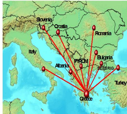
Figure 2: SEESIM 02 Participants.

The scenario developed, and used, for SEESIM 02 was a civil emergency scenario that quickly expanded to involve various agencies in all the participating countries, as illustrated in Figure 3. The close relationship between the concept defined by the NMCC architecture and the actual scenario developed and executed for the SEESIM exercise is evident by comparing these three figures. It is exciting to see the coalescing of these disparate organizations and nations into a single coordinated operation, even if so briefly. A small step toward achieving interoperability may be taking place, thanks to these various players. Another SEESIM exercise is planned for 2004. JTLS will again be used and the main process will be executed in the new Turkish War College M&S Center in Istanbul, Turkey.