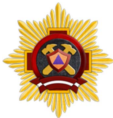
Figure 1. Logo of the Latvian State Fire and Rescue Service.

The Prime Minister has the responsibility for the continuous function of the operation of the crisis management system and for the implementation of the related tasks and obligations. The State Fire and Rescue Service, an organisation directly subordinated to the Ministry of Interior, plans, coordinates, leads and controls the civil protection operations. The State Fire and Rescue Service has significant responsibility for crisis management at national level.