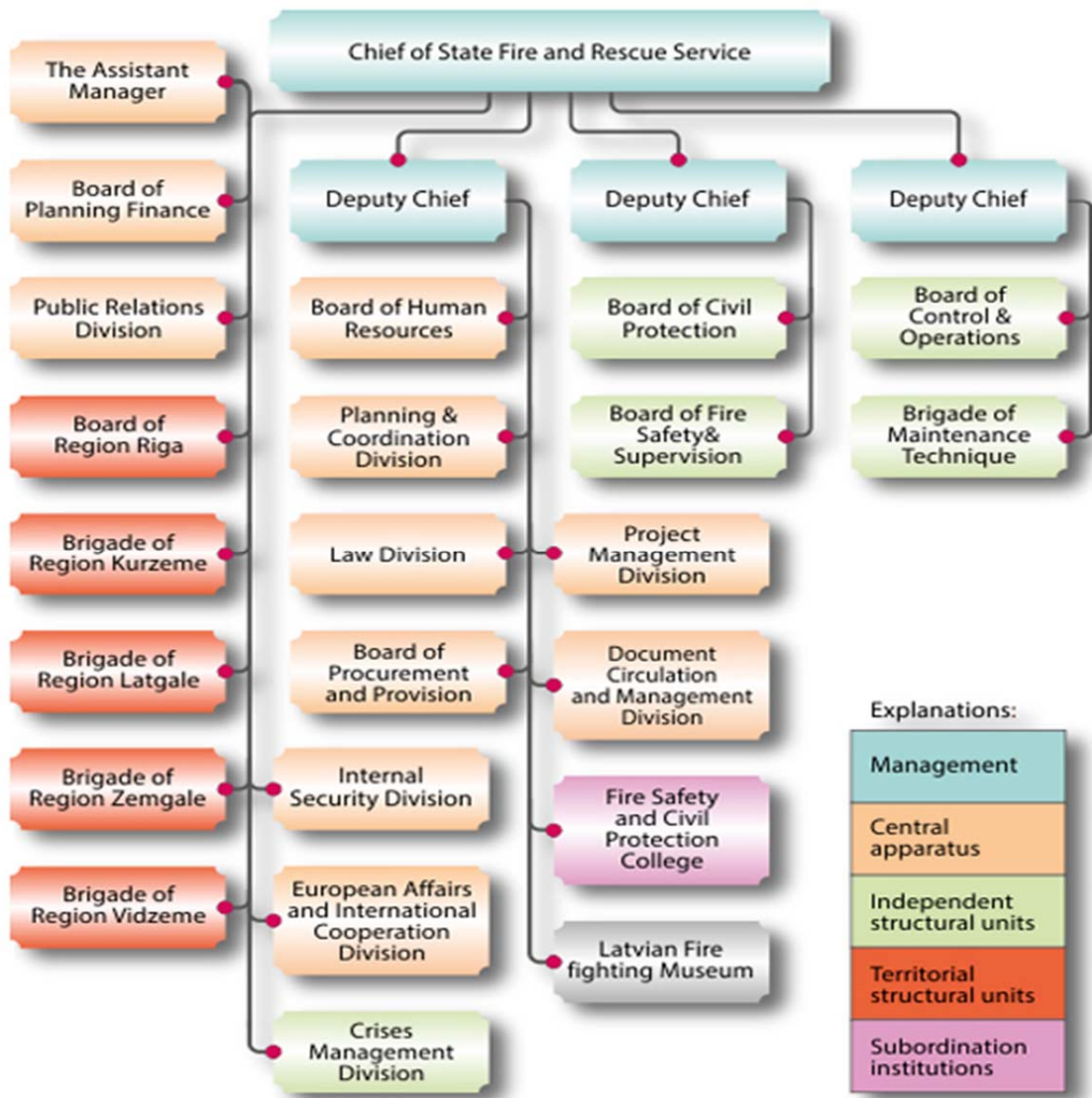
Figure 2. Structure of the State Fire and Rescue Service 90

Volunteer fire fighting units are created in some municipalities however their contribution to crisis management activities is somewhat limited. 91